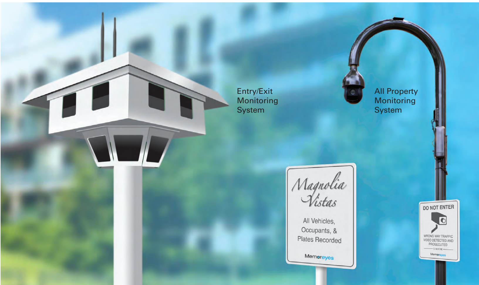
Entry/Exit Monitoring System

The remarkable, turnkey, leased intelligent surveillance solution for apartments and more.